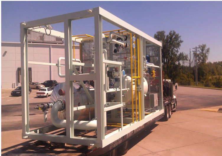
Modular Design Accelerates Project