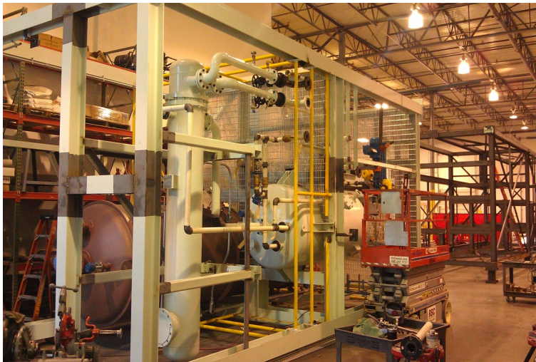
Prefabrication Enhances Quality Control