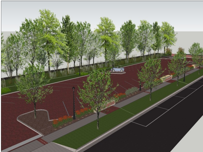
3D Rendering of Glen Ellyn Commuter Parking Lot