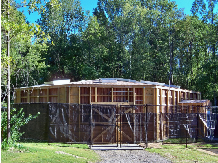
Willowbrook Wildlife Center Glen Ellyn, Illinois