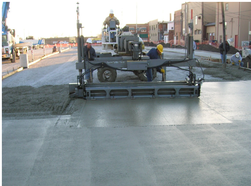
PCC Parking Lot Construction Revives Downtown