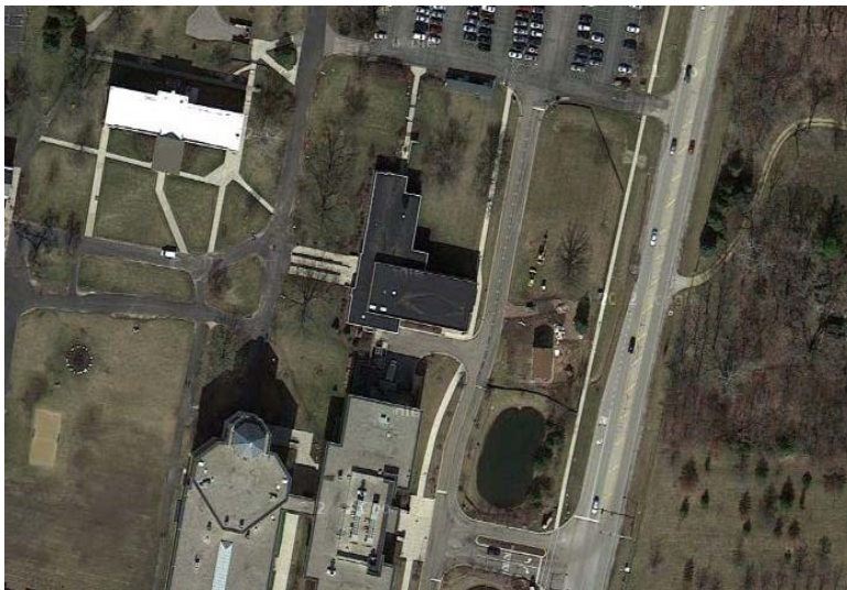
Challenging Campus Infill Project

A dedicated alumni meeting space had not previously existed on the University's Lisle campus; however a stone-façade residence dating from the 1800's (unoccupied of late) did exist near Benedictine's easterly entrance. Creation of a space with suitable outside gathering areas for alumni events, adjoining a renovated and expanded Neff House structure with offices for related uses, was the answer. Nestled between two existing stormwater management facilities, an outside patio and lawn area provide space for alumni events, while a native-planted Best Management Practice (BMP) area provides improved water-quality for site runoff before excess stormwater from the improvement is temporarily stored in one of the expanded adjoining detention facilities.