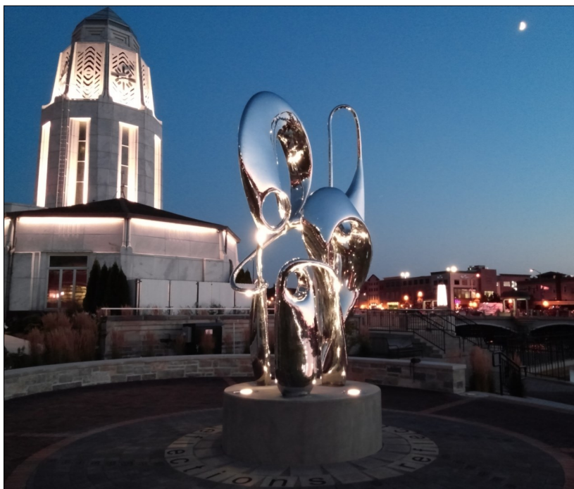
Civic Plaza—St. Charles, IL